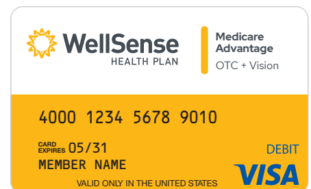
WellSense OTC + Vision debit card (mailed separately)