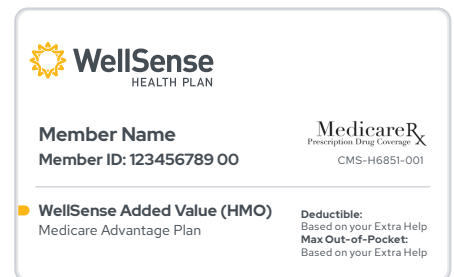
WellSense Medicare Advantage ID card

Medicare and Medicaid (if you have it) will work together to pay your benefit costs. Show both your Medicare and Medicaid cards at the doctor/pharmacy. Use your OTC + Vision card for OTC items and vision services.